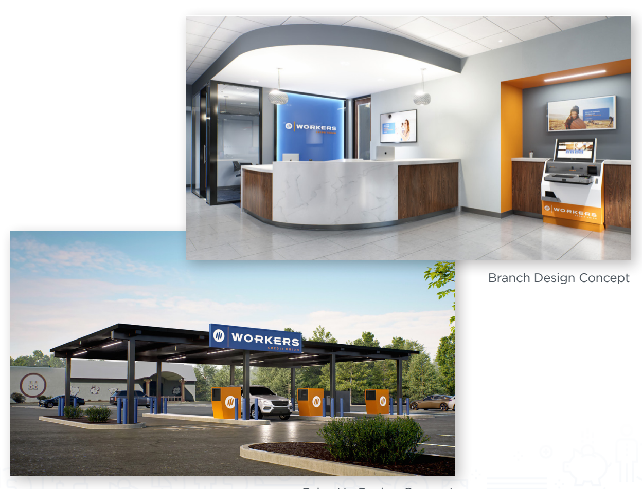
Drive Up Design Concept

Looking towards the future, we are working on renovations that will reinforce our member choice model and transform branches into modern and inviting spaces with technology that takes the friction out of banking.